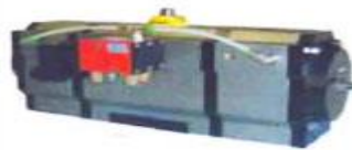
3 Position Actuators