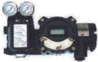
SMART POSITIONERS- EXPLOSION PROOF EEx d IIB T6 ATEX II 2 G Approved