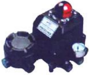
PNEUMATIC POSITIONERS WITH GAUGES PNY01-3-15PSI, Universal MTG