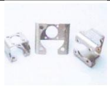
BRACKET AND COUPLINGS