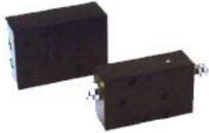
SPEED REGULATING PLATES

Important Suggestion: Use of filter regulator is the key to long life performance