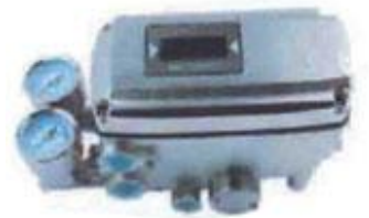
SMART POSITIONERS- STAINLESS STEEL