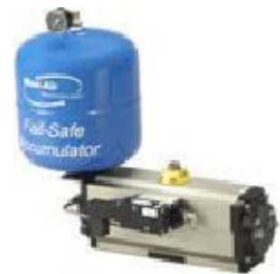
Actuators with Accumulator tank