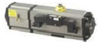
180° Center Return Actuators