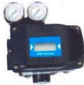
SMART SMART POSITIONERS intrinsically Safe EEx ia-ATEX II 2G approved