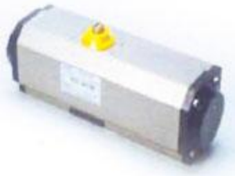
180° Spring Return Actuators