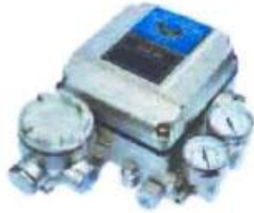
STAINLESS STEEL ELECTRO-PNEUMATIC POSITIONERS